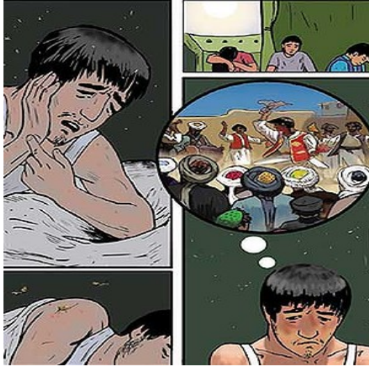
Graphic courtesy Department of Customs and Border Protection, February 2014.